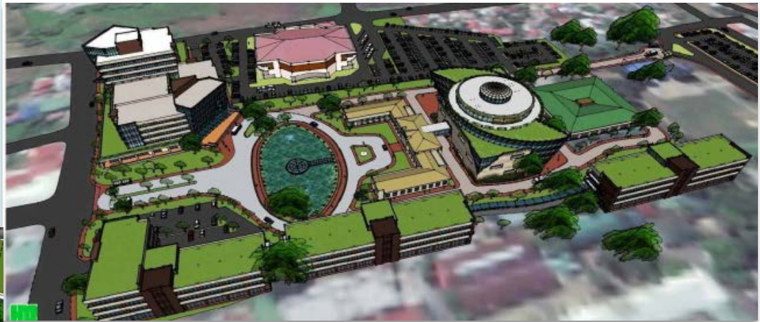
REGION 3 (CENTRAL LUZON) - THE BUNKER AT THE CAPITOL CITY OF BALANGA, PROVINCE OF BATAAN