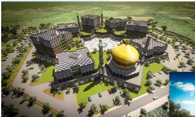
AUTONOMOUS REGION OF BANGSAMORO - MAGUINDANAO GOVERNMENT CENTER AND CENTRAL BUSINESS HUB PROVINCE OF MAGUINDANAO

Based on the initial talks made with the local officials, MTD will lease and develop 30,000 sqm of government property owned by the Province and will construct a Provincial Capitol with 9,700 sqm of floor area and a 3-storey Mosque with Dome.