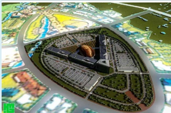
REGION 5 – THE CAMARINES SUR GOVERNMENT CENTER AND CENTRAL BUSINESS HUB PROVINCE OF CAMARINES SUR

The Province of Camarines Sur is also keen on entering into a Joint Venture Agreement with MTD Philippines, Inc. for this project, dubbed as "Region V – The Pili Complex", is estimated to cost some P 3.7 Billion (RM 277 Million or US$ 83 Million).