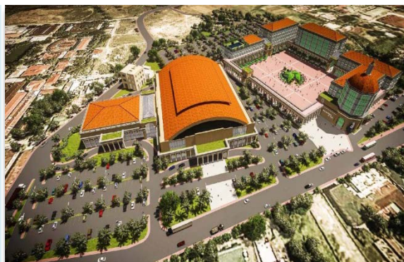
REGION 1 - PLAZA DEL PUEBLO DE VIGAN CITY OF VIGAN, ILOCOS SUR

This Facility complements the historical Spanish Colonial architectural style prevalent in the City of Vigan, Province of Ilocos Sur. The proposed buildings surrounding the plaza will have the character of the 19 th and 20 th century Spanish Eclectic architecture in which the buildings incorporate a mixture of elements from previous historical styles to create something new and original.